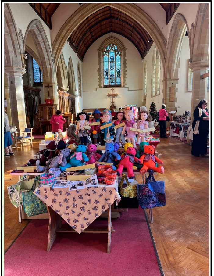
The photo above shows the recent Autumn Fair in St John's Church - read more overleaf.